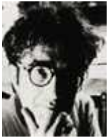
Atom Egoyan Director

MRI diagnosis machine. Magnetic Resonance Imaging allows the insides of the body to be viewed without actually using surgery.