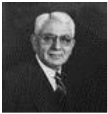
Dr. Varaztad Kazanjian