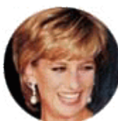
Princess Diana Princess of Wales

1/64th Armenian! The most widely known living person in the world before the fatal car accident, she was well loved for not being aloof. She made removal of landmines worldwide her cause.