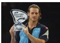
David Nalbandian Tennis

Creator and namesake of "MiG" Fighters of the Soviet Union and Russia.