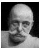
George Gurdjieff Spiritual Leader

"Mr. 5%" Made his fortune in Iraqi oil earlier this century after gaining 5% ownership of BP, and 3 other major companies. Set up a large enduring foundation.