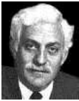
Dr. Raymond Damadian Inventor

MRI diagnosis machine. Magnetic Resonance Imaging allows the insides of the body to be viewed without actually using surgery.