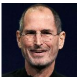
Steve Jobs Computers