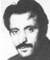
Arshile Gorky Painter

Won 1997 Cannes Grand Prize & 2 Oscar Nominations for "The Sweet Hereafter". This Cairo-born and Canadian-bred director also produced award winning "The Adjustor", "Exotica", "Ararat" and others.