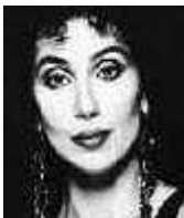
Cher (Cherylin Sarkissian) Actress, Singer

Known for Sex, Drugs, Rock & Roll and Talk Radio.