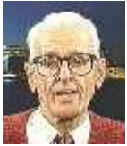
Dr. Jack Kevorkian

Founded airlines, built worlds largest casinos, owned MGM studios and still owns MGM Grand, plus large share of Diamler-Chrysler. Funds Lincy Foundation.