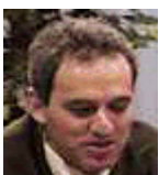
Garry Kasparov Chess

Ranked #1 in world. Serving in Russian Parliament. Was defeated for the first time by a chess computer built by IBM.