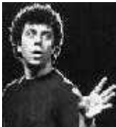
Eric Bogosian Writer/Actor

Creator of "The Chipmunks". Alvin Simon and Theodore, a popular children's cartoon. The "Chipmunks Christmas Album" is a classic.